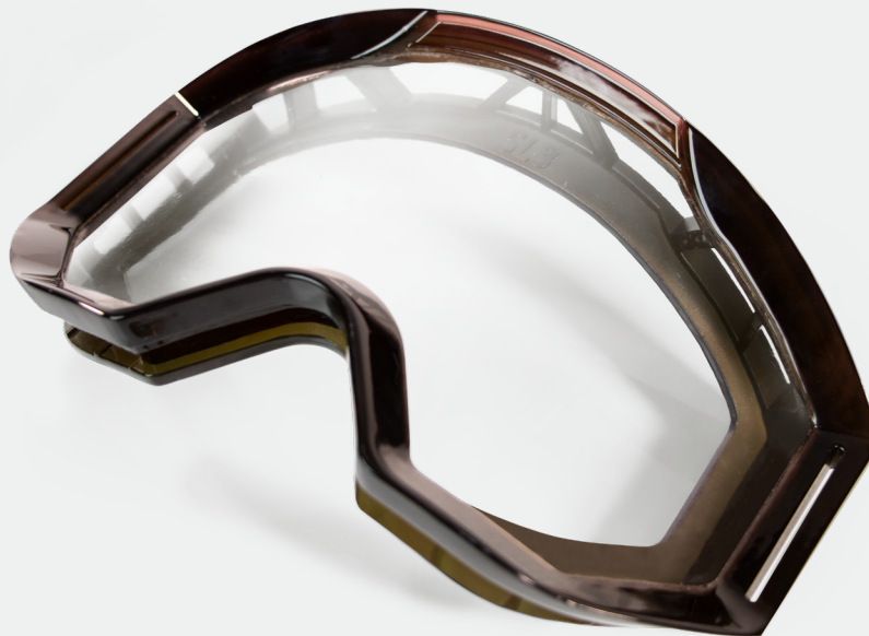
A pair of Ski Goggles

Photocentric's Durable UV SuperClear is ideal for making clear, strong objects with only minimal shrinkage. Durable UV SuperClear has been specifically developed to allow the fabrication of extremely clear objects with adjustable surface finish, to suit a variety of end-user requirements. Printed parts display a high accuracy and minimal shrinkage, allowing for the production of highly accurate clear models.