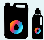
A full range of Daylight materials with wide variety of properties