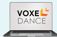
VoxelDance Support and laticing software for optimal large format printing