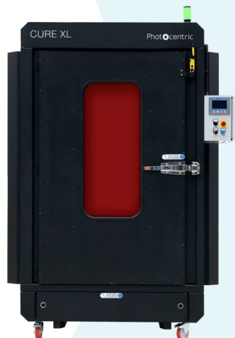
Cure XL Optimal cure for large 3D printed parts