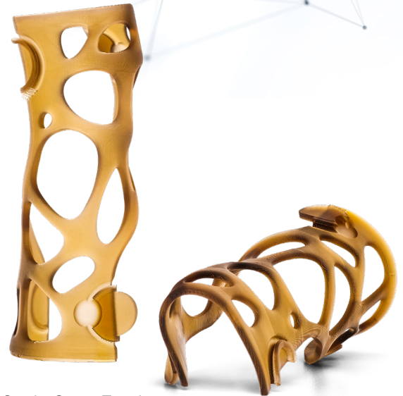
Smoky Quartz Translucent