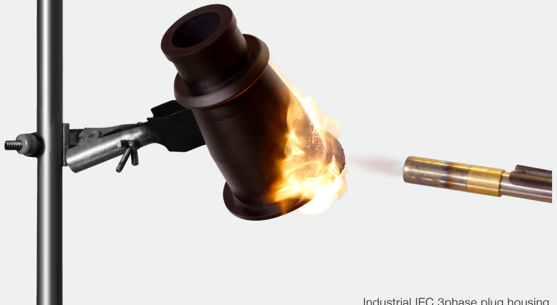
Industrial IEC 3phase plug housing

Rigid DLFR is Photocentric's first Daylight Flame Retardant resin with UL 94 V-0 certification, even showing self-extinguishing properties in the green state. Combined with an exceptionally high HDT and high tensile modulus, it is ideal for 3D parts in industries such as aerospace, automotive and railway. Easy to print and process due to its low viscosity. Printed parts exhibit a superior level of detail and dimensional accuracy, making it the perfect choice for connectors and fittings for both consumer and industrial applications.