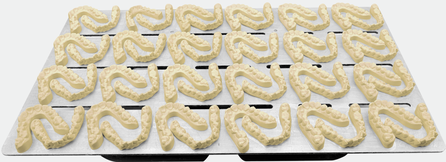
Magna Platform pictured shows 48 x Aligner Models

Photocentric Magna Dental Model Beige has been specially created for 3D printing highly detailed and accurate dental models. It provides outstanding accuracy with at least 90% of scanned models within \pm 100\mu\text{m} tolerance, perfect for Aligner Dental Model production. Using Magna Dental Model Beige ensures a dry surface finish, accurate detail and great mechanical stiffness, shorter print and post process cycles with a high Shore hardness of 84D.