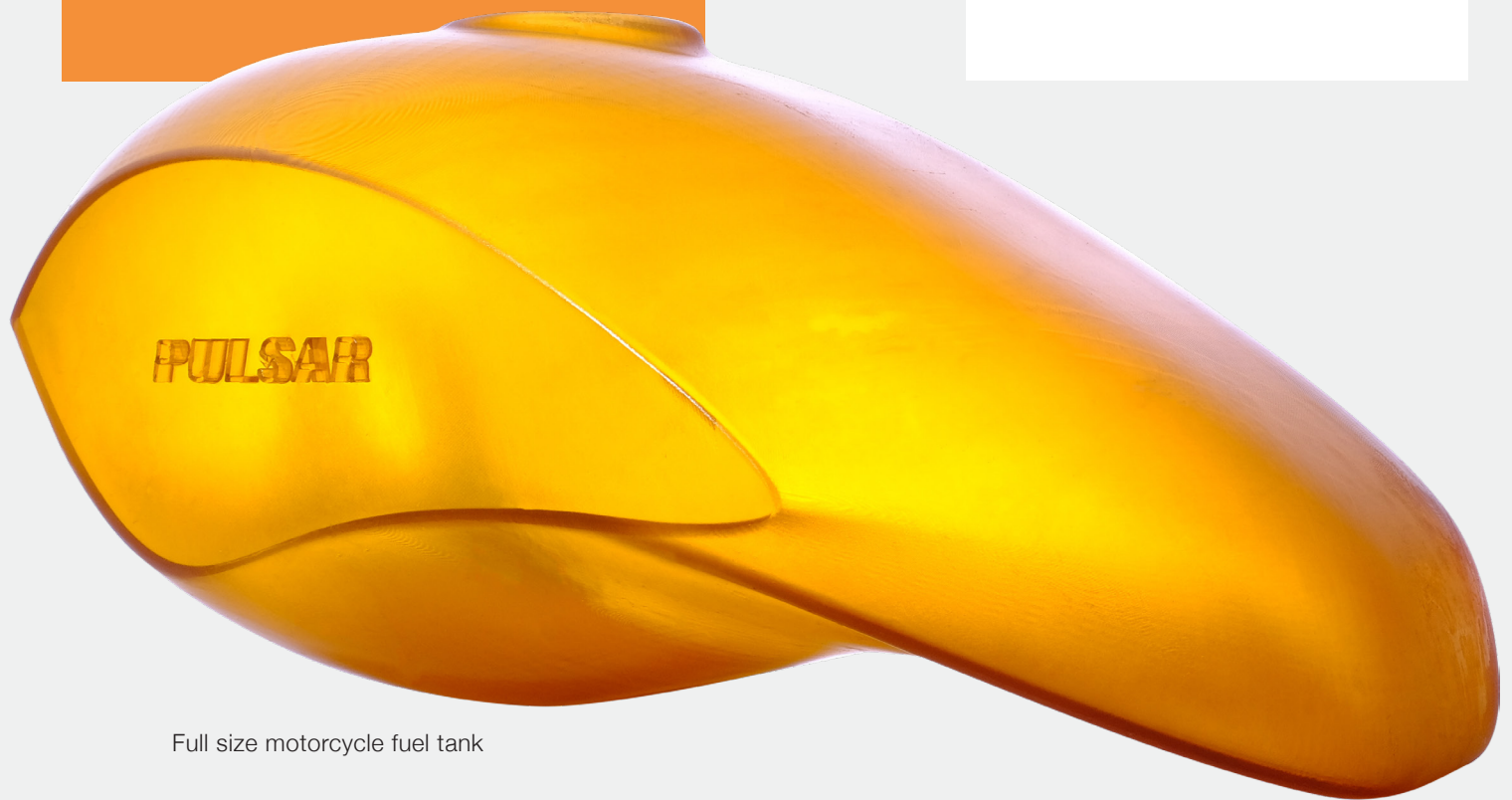
Full size motorcycle fuel tank

Photocentric's High Temp DL400 is the first Photocentric high temperature resistant resin possessing superior properties of both strength and stiffness. It can handle impact, compression, fatigue, high temperatures and moisture without bending or deforming, able to print with an impressive layer thickness of 350µm.